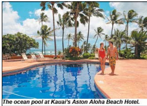
The ocean pool at Kauai's Aston Aloha Beach Hotel.